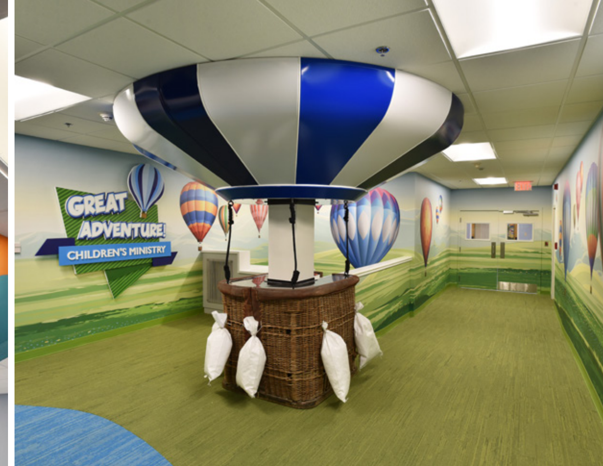
FIRST BAPTIST CHURCH OF ATHENS Athens, GA