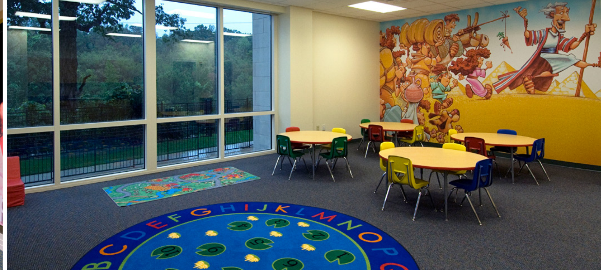
MOUNT PARAN Atlanta, GA