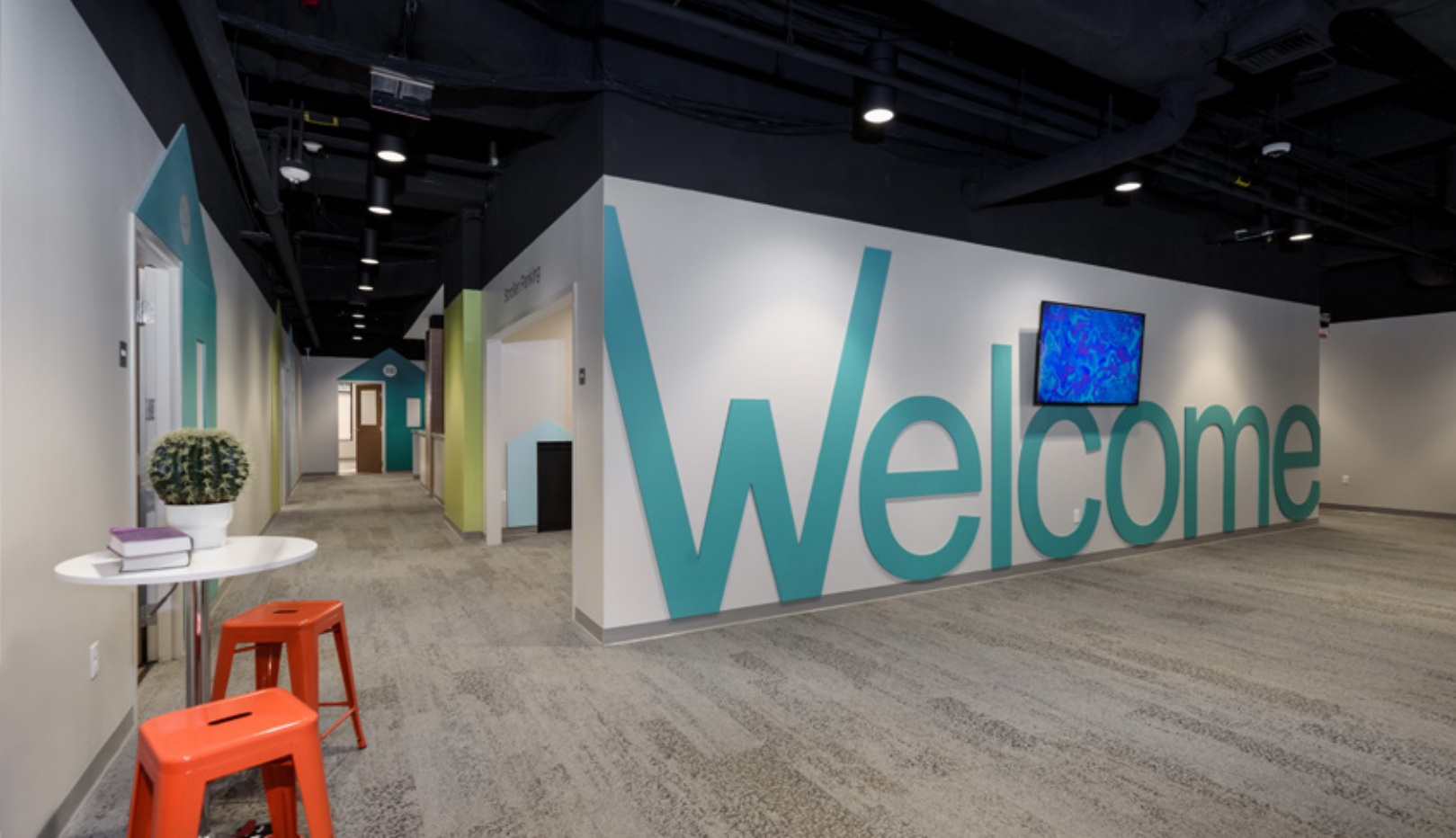
FIRST BAPTIST ORLANDO Orlando, FL