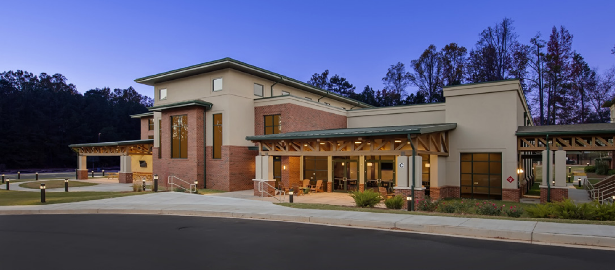
FELLOWSHIP BIBLE CHURCH Roswell, GA