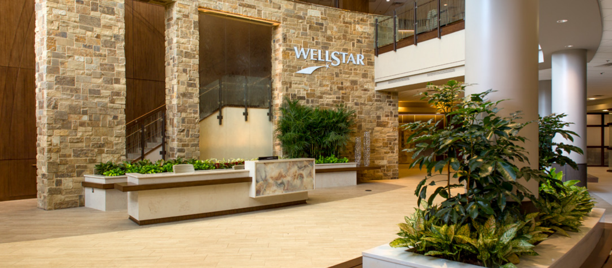
WELLSTAR EAST COBB HEALTHPARK Marietta, GA