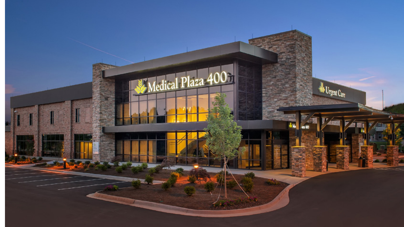
MEDICAL PLAZA 400 Dawsonville, GA