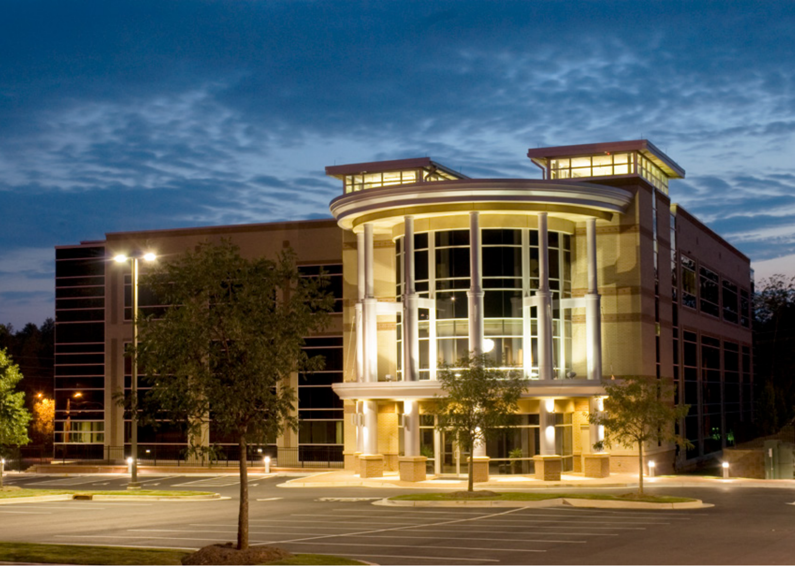
TOWER ROAD MEDICAL OFFICE BUILDING Marietta, GA