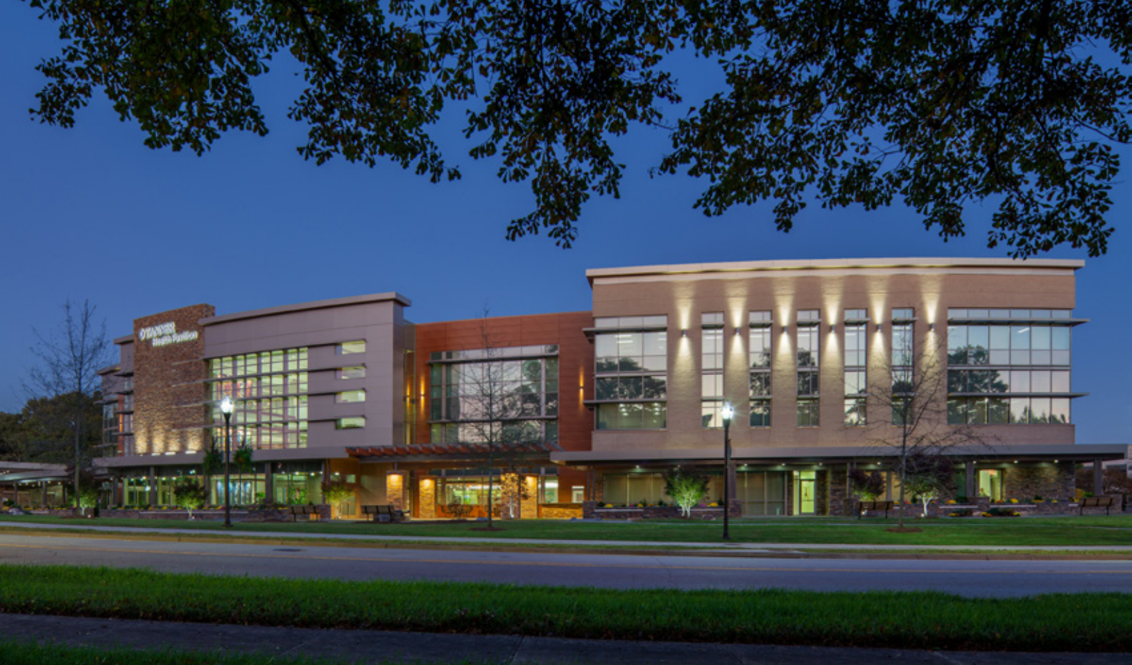
TANNER HEALTH PAVILION