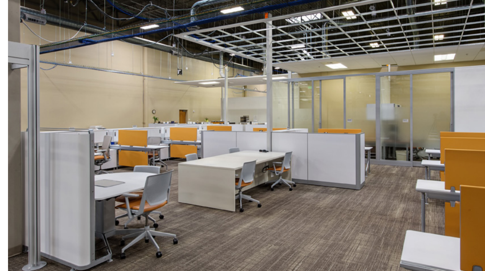
NORTHEAST GEORGIA CORPORATE PLAZA Gainesville, GA